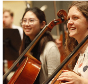
Australian Youth Orchestra