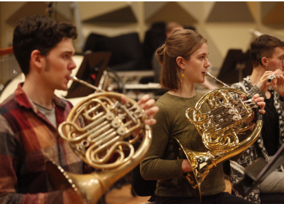
Australian Youth Orchestra